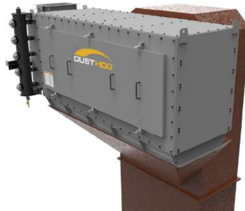
Bucket Elevator Arrangement