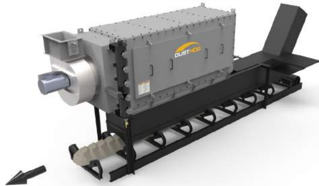
Conveyor Transfer Point Installation